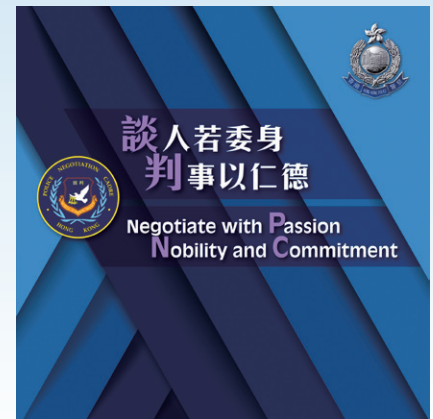
▲ The new Police Negotiation Cadre themed book.

In second half of 2022, three books including the Police Museum themed book to celebrate the re-opening of the revitalised Police Museum in September 2022; the book for Yau Ma Tei Division with the theme on 'Policing with the community for over 100 years'; and the book for Marine Police in celebrating its 180 th anniversary of the establishment are to be released.