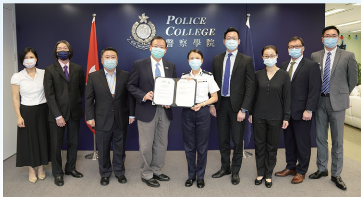
▲ Representatives from HKPC and LSCM take a photograph after the MoU signing ceremony.