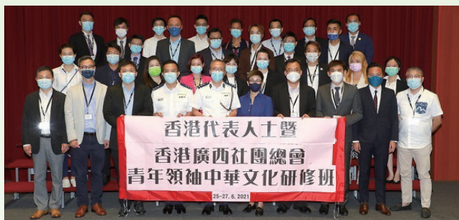
▲ Delegates from the Federation of Hong Kong Guangxi Community Organizations.

On 25 th June 2021, a 32-member delegation from the Federation of Hong Kong Guangxi Community Organisation visited the Aberdeen Campus, School of Foundation Training (SFT) under the arrangement of the Hong Kong Institute of Public Administration. The visit programme included tour round the Aberdeen Campus with sharing sessions, aiming for a better understanding of the training offered by the Police College. The sharing sessions covered topics like the array of training syllabus, organization structure, integrity management, quality assurance mechanism, the application of technology & virtual reality in training, etc.