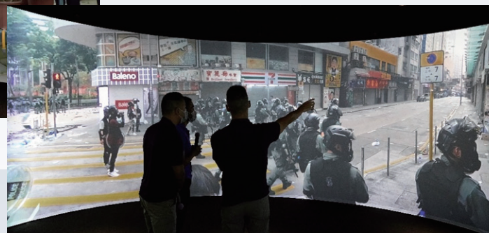
▲ PTU Cadre Course training on riot situation at the Studio ImmerXe.