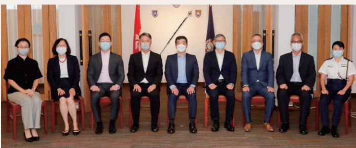
▲ The management of the Police College appreciates the Accreditation Panel's contribution in enhancing the quality assurance of RPCs and PIs