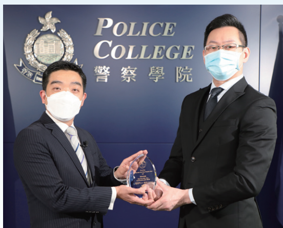
▲ D HKPC (left) and DD2 HKPC (right) receive the awards on behalf of the Force

The Global MIKE Award marks the highest level of accolades in the KM field and is a global benchmark in assessing KM and innovation practices.