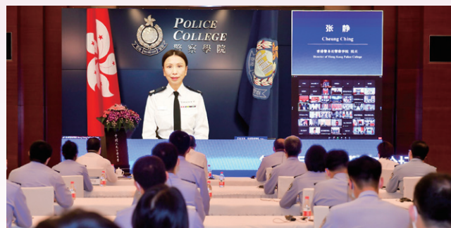
▲ Former D HKPC CHEUNG Ching gives a keynote speech at the opening ceremony of the 12 th International Policing Forum