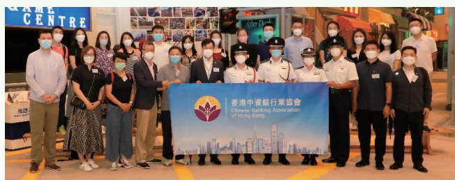
▲ HKCBA delegates visit Tactical Training Complex of Aberdeen Campus.