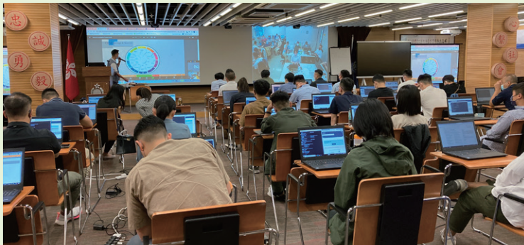
▲ Trainees of SCIC attend FIIB's Workshop during Topical Crime Week.

and Technology Crime Bureau, Commercial Crime Bureau and Financial Intelligence and Investigation Bureau (FIIB) to introduce a 'Topical Crime Week' in the Standard Criminal Investigation Course (SCIC) starting from July 2022 for enhancing trainees' capability to investigate topical crimes, i.e. Technology, Deception and Money Laundering related crimes. To this end, the training of related topics in SCIC are revamped to address the prevalent crime trend as well as the latest investigation skills and tools comprehensively.