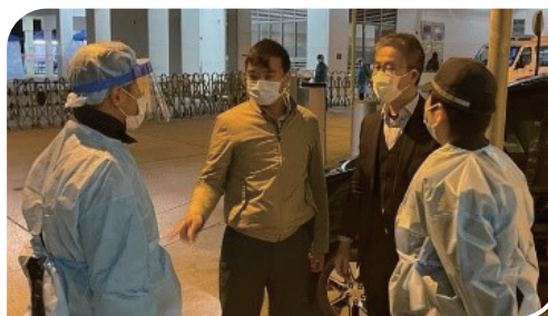
▲ The Commissioner (third left) pays visit to the Composite Company at the RTD operation

The unprecedented turnout of the Composite Companies for RTD and CIFs operations has successfully assisted in fending off the Fifth Wave of the COVID-19 and meanwhile alleviating the manpower pressure of the frontline in maintaining daily order and law duties.