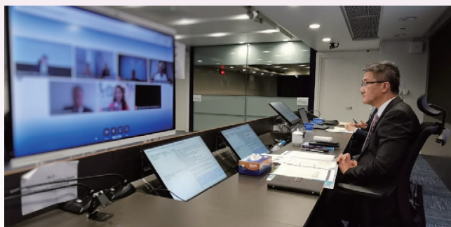
▲ The Commissioner, in his former capacity as DCP OPS, virtually meets with police chiefs during the 14 th Pearls in Policing Conference

In order to maintain close liaison with counterparts worldwide to resume and exploit opportunities for global collaboration, D HKPC WONG Chung-chun, Dick will lead a delegate to participate in the 23 rd INTERPOL Police Training Symposium to be held in Saudi Arabia between 26 th and 28 th September 2022, exhibiting the Police College's determination in striving to become a leading centre of excellence in police training and development in the international arena.