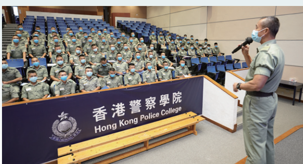
▲ RPCs on IM lecture in Aberdeen Campus

With a view to strengthening trainees' confidence in actual appreciation of and their abilities in incident handling, a new Virtual Reality (VR) package relating to "Off Duty" IM related scenes (under alcohol influence & impulsive emotions, sex related offences, undesirable association as well as fraud) has been implemented since November 2021.