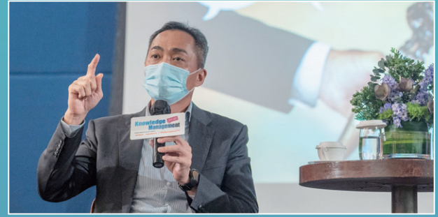
▲ Former DCP MAN KWOK Yam-shu, highlights the personal qualities of successful leaders

▶ Participants respond overwhelmingly in sharing session