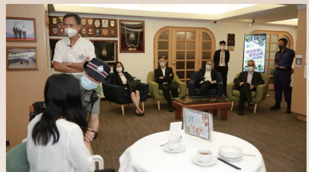
▲ Practicality and coherence of RPCs and PIs training curriculum was showcased to the Accreditation Panel during the On-site Assessment training on 2 nd June 2022

The Police College's quality assurance competency and track records on accreditation were highly recognised by the Hong Kong Council for Accreditation of Academic and Vocational Qualifications by conferring the 'PAA Operator Award' in June 2021.