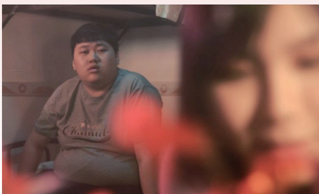
▲ Video capture relates to 'The Disappearing Body'

The 'Use of IT in Police Training' video, produced by LTD, also won a Bronze Award under the category of 'Non-Profit Organisations: In house Production'. The video showcased various technologies being utilised in the Police College, including the use of 'VR Scene' by the School of Foundation Training (SFT), 'Detective Boulevard' by the Detective Training Centre (DTC), 'Driving Simulator' by the Police Driving & Traffic Training Centre (PD&TTC) and 'Integrity Management Trail' by SFT, DTC and PD&TTC.