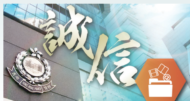
▲ IM Briefing Package