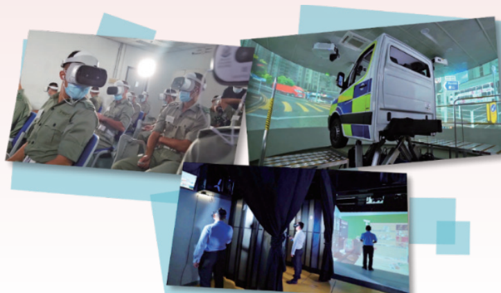
▲ Video capture relates to Virtual Reality training