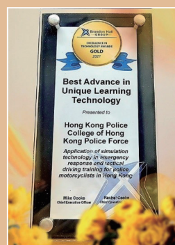
▲ Police College wins Gold Awards of the '2021 Brandon Hall Group Excellence in Technology Award'.