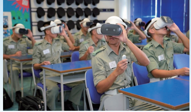
▲ RPCs on IM lecture in Aberdeen Campus

As such, the scenario-based training packages of 'VR Scene' were designed to consolidate RPCs' understanding on the taught theories, police powers and a quick recollection on the handling procedures. The interactive training scenarios included various 'watch and ward' duties like 'dead body found', 'arrest and exhibits handling', 'stop and search / stop and question', 'road block', 'report room' and 'integrity management'.