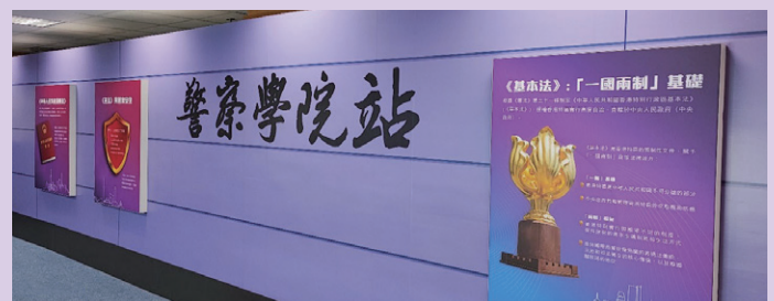
◀ ▲ NS Express National Security Exhibition at Aberdeen Campus

In early 2022, the National Security Department and the Police College organised the 'NS Express National Security Exhibition' at the Aberdeen Campus and have set up the "Force National Security Book and Publication Corner" at the Force Library in PHQ, with a view to enhancing officers' knowledge of national security, reinforcing patriotism as well as marking the 25 th Anniversary of the Establishment of the Hong Kong Special Administrative Region and the Chinese People's Police Day on 10 th January 2022.