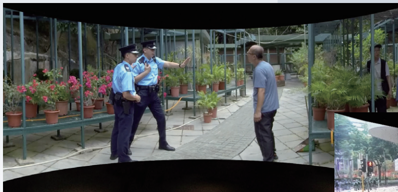
▲ 360-degree video to simulate a 'Dispute' incident at the Studio ImmerXe.

The Police College will continue to explore and expand the usage of Studio ImmerXe with the aim of strengthening the training capabilities of the Force.