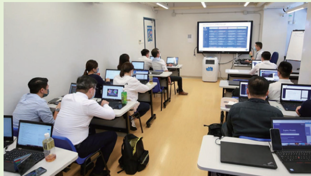
▲ CSTCB Training on Technology Crime