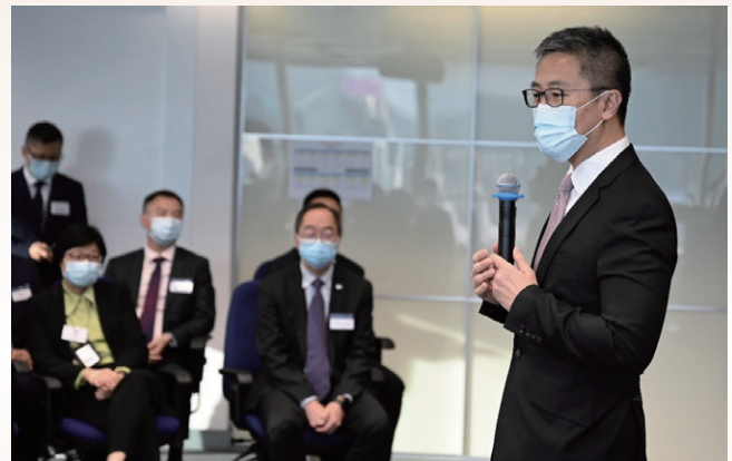
▲ The Commissioner shares his insight on Strategic Leadership