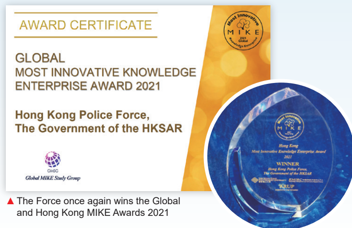
▲ The Force once again wins the Global and Hong Kong MIKE Awards 2021